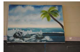
Suzanne M. Burns (July 28, 1948– April 3, 2011)